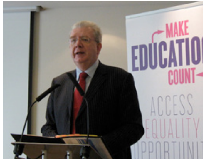
Mike Russell, Education Minister, addressed Congress on a range of issues, and answered questions on various topics including GCU London

Amongst the points that Mike Russell put to congress, was the government's belief that the existing four year degree was not a weakness, but a strength , and had to remain the cornerstone of what the Government offered.